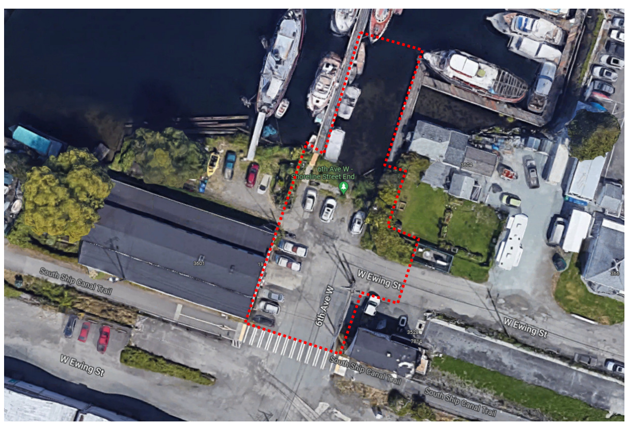
Project Area Map